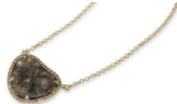
Diamond slice necklace in yellow gold (HK$14,740) by Lorde Jewellery, www.lordejewellery.com .